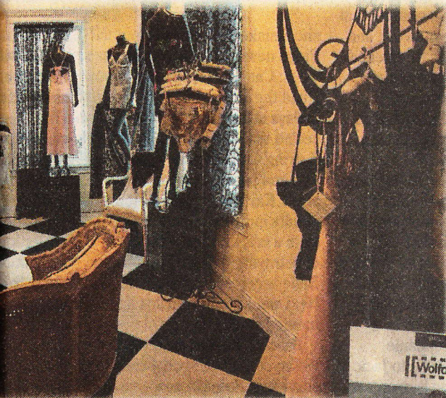
La Silhouette lingerie shop at 6914 Miami Ave. in Madeira used to be an antiques shop. Below: Wolford hosiery ($22-$65) at La Silhouette.